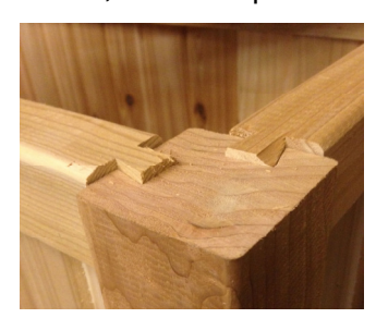
Step 3: Lock Panels into legs. Using the supplied Wood Block and a hammer, drive the panel until flush with top of leg. (See pictures)

Step 2 : Insert Panels with BOTTOM SUPPORTS into those legs, Bottom Supports toward you. Repeat for other Panel with Bottom Supports. USE the SLOTS as per the picture above. Then, slide END panels into Legs of completed panel. Should look like picture to left.